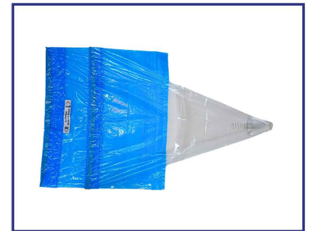
Calibrated Obstetric Drape