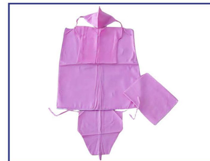
5-Piece Synthetic-Mix Newborn Baby Kit