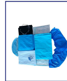
Disposable HIV Kit