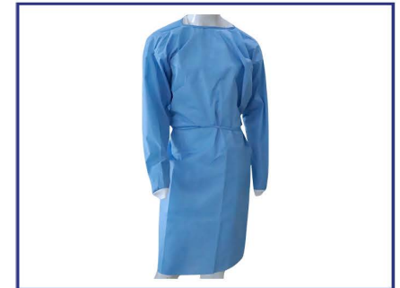
Disposable Surgeon Gown (40 & 43 gsm SMS Non-Woven Fabric)