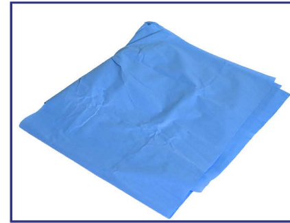
Disposable Bed Sheet (28 gsm Non-Woven Fabric), 47" x 96"