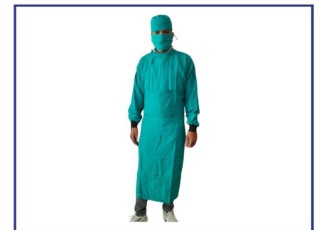
Reusable Surgeon Gown