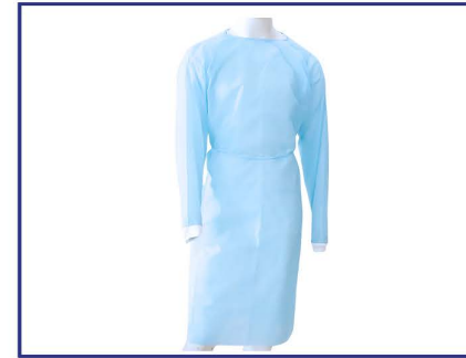
Disposable Patient Gown (28 gsm Non-Woven Fabric)