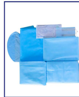
Disposable OT Kit