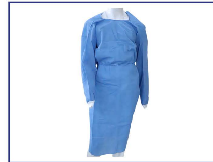
Disposable Surgeon Gown (40 & 43 gsm Non-Woven Fabric)