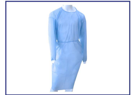
Disposable Surgeon Gown (28 gsm Non-Woven Fabric)