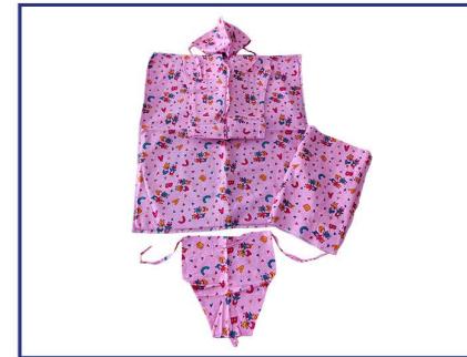
Printed 5-Piece Synthetic-Mix Newborn Baby Kit