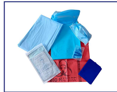
Disposable Delivery Kit