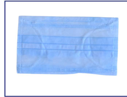
3-Ply Face Mask with Melt-Blown (MB) Outer Elastic