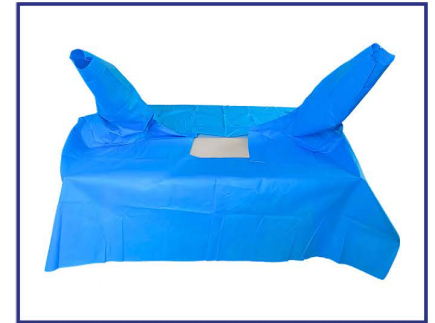
Perineal Sheet with Centre Hole & Leggings Attached (43 gsm SMMS Fabric)