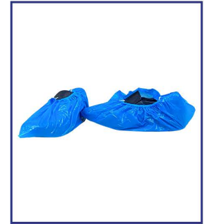
PE Shoe Cover