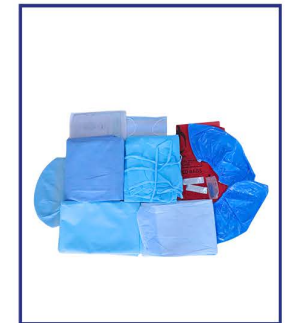
Disposable Maternity Kit