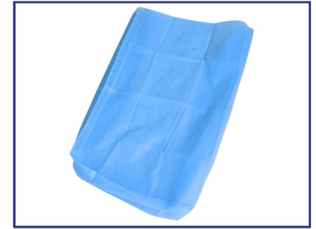
Disposable Pillow Cover (28 gsm Non-Woven Fabric)