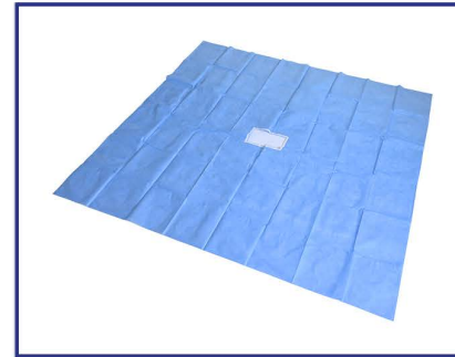
Perineal Sheet with Centre Hole (43 gsm SMMS Fabric)