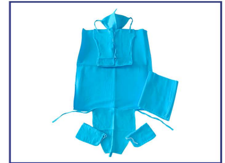
7-Piece 100% Cotton Newborn Baby Kit