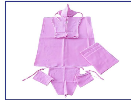
Printed 7-Piece 100% Cotton Newborn Baby Kit