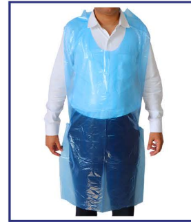
Plastic Apron, 32" x 42"