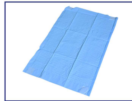
Disposable Bed Sheet (20 gsm Non-Woven Fabric), 31.5" x 70"