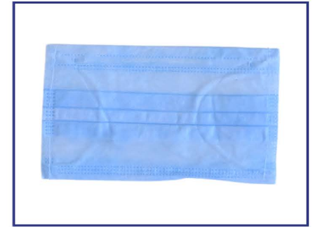
3-Ply Face Mask with Melt-Blown (MB) Inner Elastic