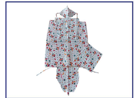
Printed 5-Piece 100% Cotton Newborn Baby Kit with Wool Blanket