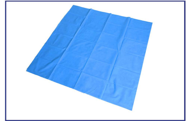
Underpad Sheet (45g, 55g, 60g)