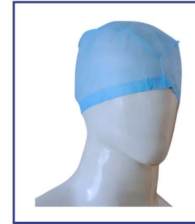
Disposable Surgeon Cap