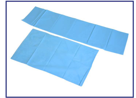
Disposable Bed Sheet (40 gsm Non-Woven Fabric), 47" x 96"