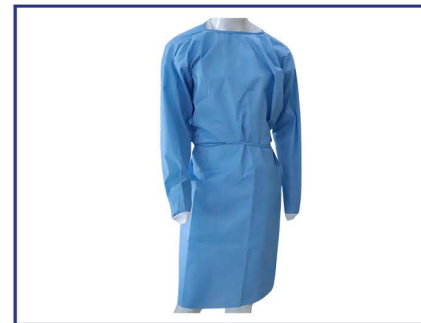
Disposable Surgeon Gown (40 & 43 gsm SMMS Non-Woven Fabric)