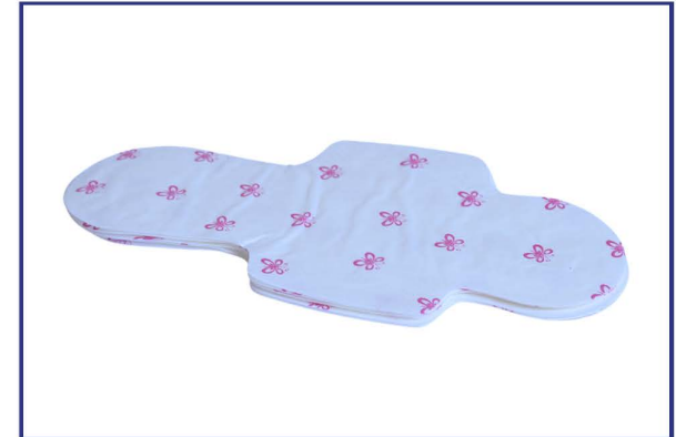
Ultra-Thin Sanitary Pad